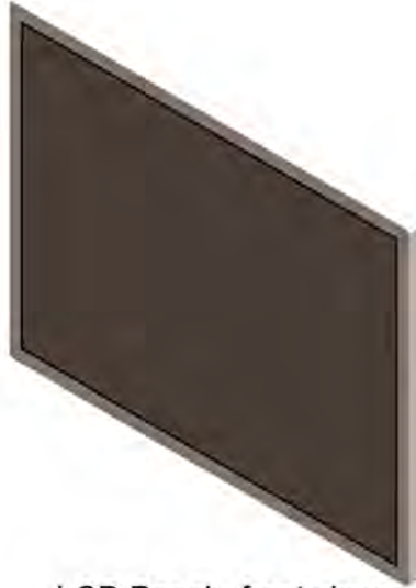
LCD Panel - front view DC-002, DC-003